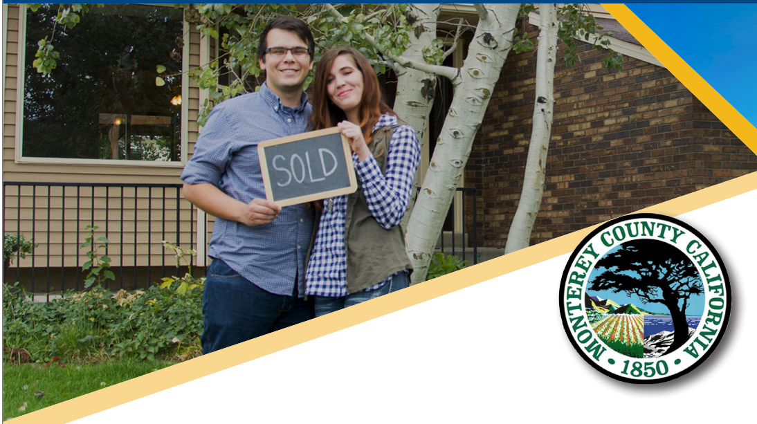
Monterey County, CA